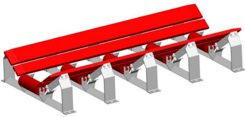
Above: Drawings of standard K-Sure® Belt Support System. Customised variations available to suit.

This problem is known as Belt Edge Sag and it is usually caused when there are too few idlers installed at the loading point.