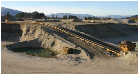
Above: Customer's quarry site, one of 40 different sites across New Zealand.

This New Zealand based customer's core business is based around their quarry activities. They are a major supplier of quarried products to the construction industry, with raw materials extracted and processed from over 40 different sites around the country.