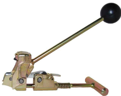
P1 Punch-lok Tool