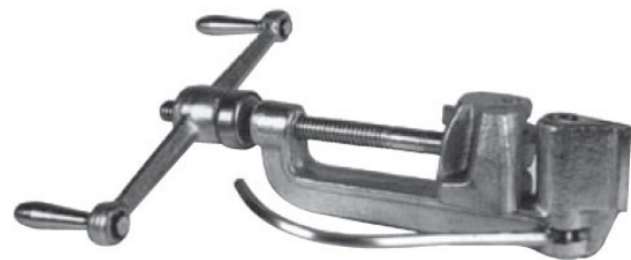
PB001 Punch-lok Banding Tool