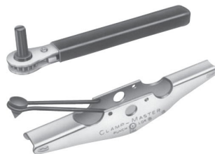
P38 Clamp Master Tool